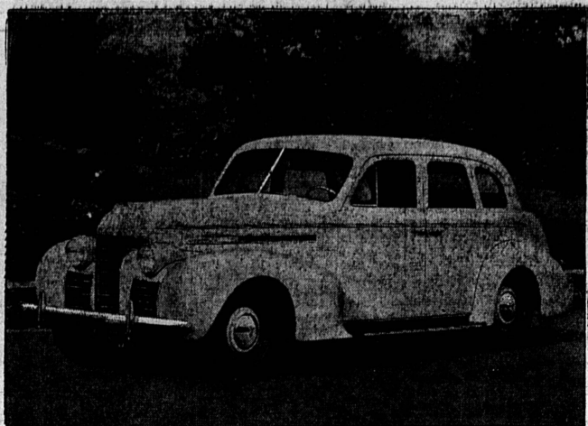
OLDSMOBILE'S LATEST . . . Here is the 1939 Oldsmobile Six Series 70 on display popular four-door trunk sedan model of the Mullin Motors, 2053 Torrance boulevard.

Basch Brothers, Torrance contracting firm which has built some of the larger state highway links in the state, submitted the low bid and is expected to be awarded the contract this week for a $90,204 job on the Kane Springs-Oceanside highway at La Jolla Indian reservation in San Diego county. The job is a Federal lands highway project.