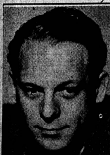
DEDICATION 'EMCEE' ... Bill Goodwin, ace KNX-CBS announcer, has been assigned to act as master-of-ceremonies at the festivities in the Civic Auditorium marking the formal opening of the new transmitter station. Broadcast at 9:30 p.m.