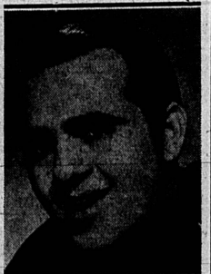
CUBAN TENOR ... Chiquito will add color as well as music to the gala remote-control broadcast Friday night when he appears in native costume to sing luring tangos, gay French tunes and rumbas.

OPPORTUNITIES HERE Manufacturing opportunities in Torrance await makers of carpets, washing machines, ironers, awning cloth and canvas.