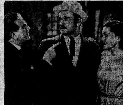
Frank Morgan, Wallace Beery and Maureen O'Sullivan are featured in "Port of Seven Seas," romantic drama now showing at the Plaza theatre in Hawthorne.