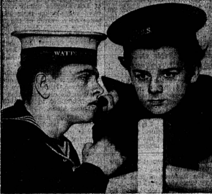
Mickey Rooney and Freddie Bartholomew in "Lord Jeff" are opening Sunday at the Torrance theatre. This is a gripping story of the training of British boys for the Merchant Marine.