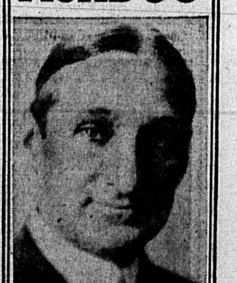
U. S. SENATOR

"Your retirement from the Senate would be a distinct loss to the public." —FRANKLIN D. ROOSEVELT There is No Substitute for Experience