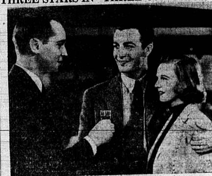
Here are Franchot Tonne, Robert Taylor and Margaret Sullivan—three stars in their own right—in a scene from the post-war drama "Three Comrades" one of the outstanding screen offerings of the current season which opens tonight at the Plaza theatre in Hawthorne.