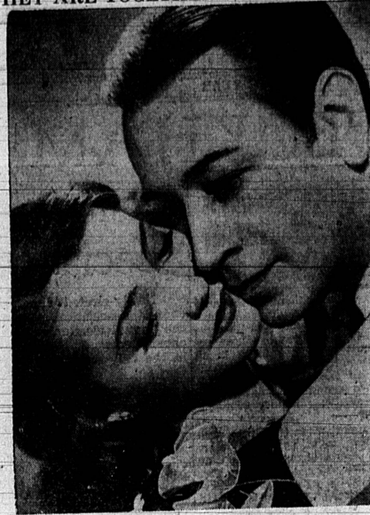
The stars who thrilled movie-goers in "Pick Up Sylvia Sidney and George Raft, are together again in Paramount's thrilling drama of love on parole, "You and Me," opening tonight at the Torrance theatre.