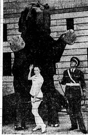
Left: Trained elephants which will perform in the huge circus being staged by the Legion as one of the features of its Independence Day spectacle. Other circus acts include world renowned aerialists, cyclists, tumblers, trained Bengal tigers and a whole Congress of Clowns. The show will open with a parade featuring, in addition to Legion-sponsored youth groups, the pick of the Legion's drum and bugle corps and the Auxiliary drill teams.