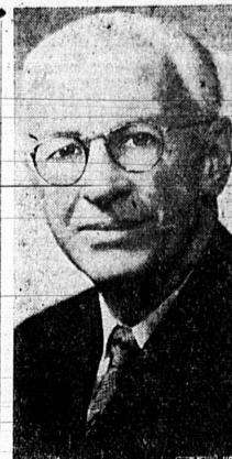
JUDGE A. F. MONROE ... knows human foibles

A kindly veteran of the bench who believes in the humanities first and interprets the law in the light of human need, is Judge A. F. Monroe of the Inglewood Township Justice Court, office No. 2. As a candidate for re-election at the forth-coming election, Judge Monroe brings to the bench over 20 years' experience as Justice of the Peace of Inglewood Township. He was appointed to the justice court Nov. 1, 1915, and elected to that bench in November of 1918. The first civil case in the township court was filed Dec. 21, 1915; the first criminal case filed 15 days later.