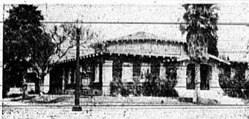
CENTRAL EVANGELICAL CHURCH ... $26,000 valuation and debt-free

F. L. PARKS OPPOSITE POST OFFICE PHONE 60 1418 MARCELINA AVENUE