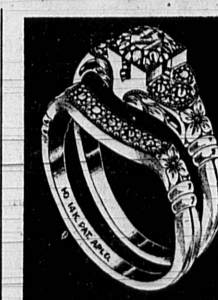
One of the most beautiful "RING-LOK" models.

12 Blue-White Diamonds exquisitely set in mountings as shown, $99.50