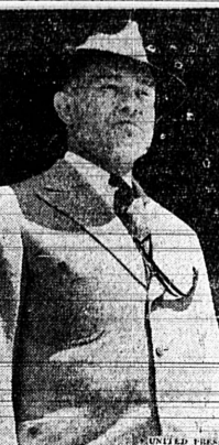
Secy. of War Harry H. Woodring, as caught by a candid camera, while he reviewed a military parade in his honor at St. Louis, Mo.