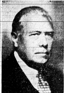
Myron C. Taylor

Who retired Monday as chairman of the U. S. Steel directorate. Fifty-four years old, Taylor is a Cornell graduate, attorney and specialist in corporation management who was elected to "Big Steel's" board in 1925. He had served as chairman since 1932 and is succeeded by