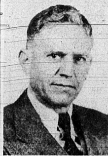
WILLIAM H. BRATTON