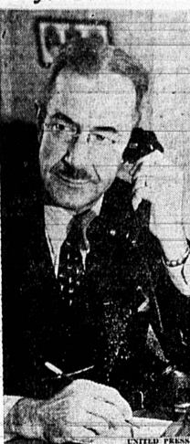
William Jennings Bryan Jr., son of the "great orator," assumes his new duties as collector of customs at Los Angeles after his appointment by President Roosevelt.