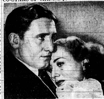
Spencer Tracy and Joan Crawford carry leading roles in "Mannequin," a story of a girl's rise from the squalor of a New York tenement to a penthouse, which opens Sunday at the Plaza theatre in Hawthorne.