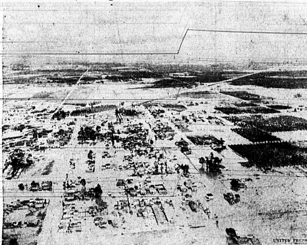
One of the outlying communities suffering most severe damage in the Los Angeles flood was the city of Anaheim, pictured above as flood waters raced through its streets. More than 12 lives were lost in this area.