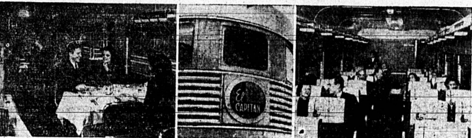
The new El Capitan, 3934 hour flyer between Chicago and Los Angeles, is unique because it is the only transcontinental train in America reserved exclusively for chair car passengers. It is equipped with deeply cushioned reclining chairs, broad windows, large dressing rooms and a lunch-counter diner.