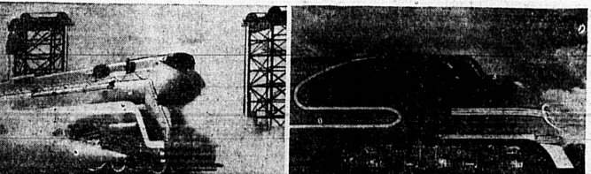
The Iron Horse on the Santa Fe Chief goes streamlined! Its multi-powered steam engine is capable of a speed of 110 miles per hour. (Right) One of the Super Chief's 3600 H. P. Diesel-electric locomotives.