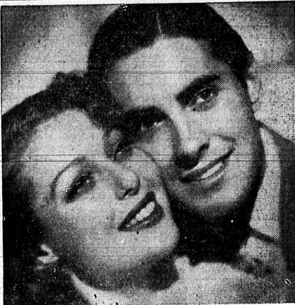
The fun-making and love-making sweethearts of "Love is News" and other romantic comedies, Tyrone Power and Loretta Young really put their hearts into the romance of "Second Honeymoon," now showing at the Plaza theatre in Hawthorne.