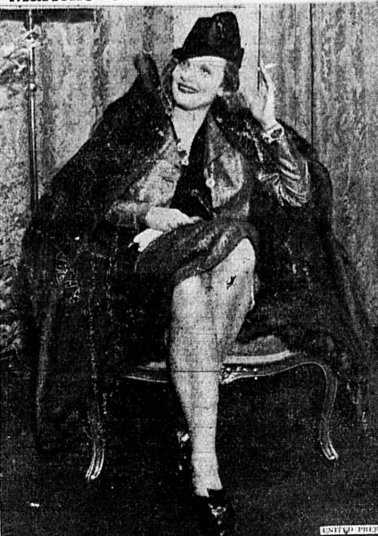
Crossing her knees to emphasize (among other things) her determination to obtain better pictures in the future, Marlene Dietrich is shown above in San Francisco, where she announced jokingly she was on a "sit-down" strike against her producers. Her contract expires Feb. 15 and she wants a chance to play in independent productions and to be allowed to pass judgment on her future scenarios.