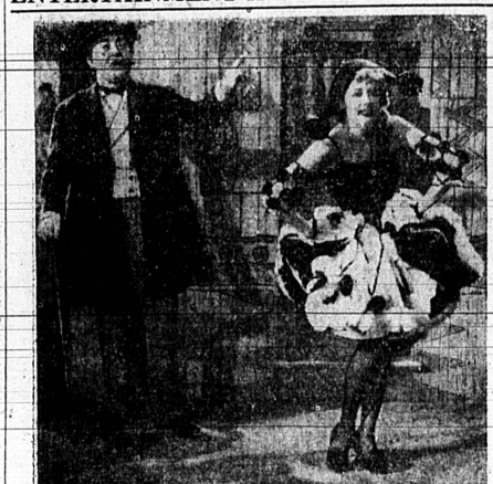
The charming little "earny" dancer is Irene Dunne, the genial barker is Raymond Walburn, and the action takes place in "High, Wide and Handsome," the gripping story of Pennsylvania during the days when oil was discovered, which opens Thursday night at the Torrance theatre.