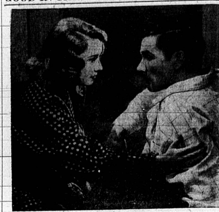
LESSONS IN LOVE—Errol Flynn (of all people) gets them, and Joan Blondell gives them in "Perfect Specimen." It will be the next attraction at the Plaza theatre. Starting Christmas with Shirley Temple in "Heidi."