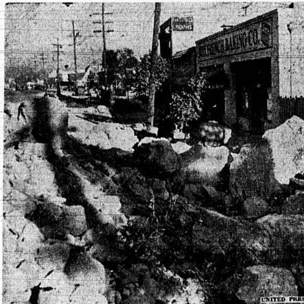
Its major slide completed, the bluff is shown above as it comes to a halt a few feet from stores and homes on Riverside Drive. Crews today are working to remove the debris, piled 40 feet high in some places.