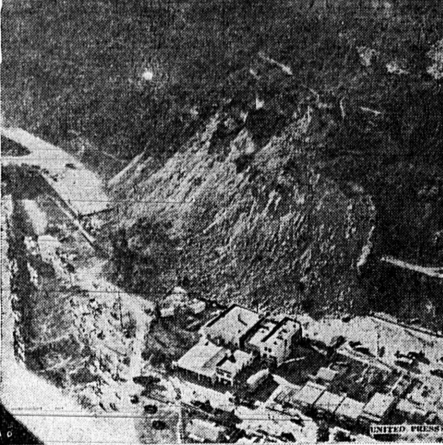
An aerial view of the Elysian Park bluff above Riverside Drive in Los Angeles as thousands of tons of rock and earth break loose, threatening to fall for nearly a month.