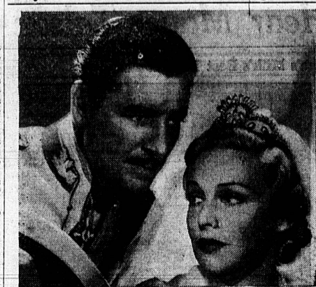
The beautiful romance of Rassendyll and Princess Flavia is played by Ronald Colman and Madeleine Carroll in David O. Selznick's production of "The Prisoner of Zenda," starting Saturday at the Plaza theatre in Hawthorne.