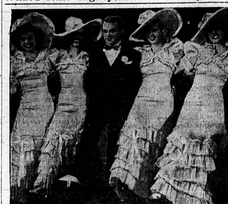
James Cagney and a bunch of lovelies are just about to go into their dance in "Something to Sing About," the romance with music and dance which affords Jimmie the opportunity to display his hoofing and vocal talents. It opens tonight at the Torrance theatre on a double-feature program.