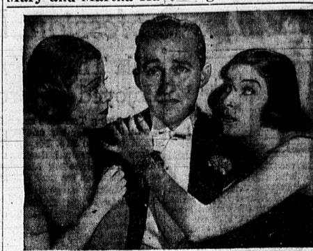
Bing Crosby has heart and hands full with Mary Carlisle and Martha Raye in his latest comedy "Double or Nothing," which opens a three-day run tonight at the Lomita theatre. Bing's latest venture into the realm of comedy concerns a freak will, a night club on wheels and a race to win a million. He is aided and abetted by a brilliant comedy cast.