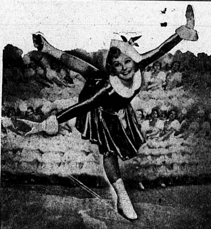
Silvery Alpine slopes provide a gorgeous background for the romantic story of "Thin Ice," featuring Sonja Henie, premier skater shown above, and Robert Taylor. The film opens Saturday night at the Plaza theatre in Hawthorne.