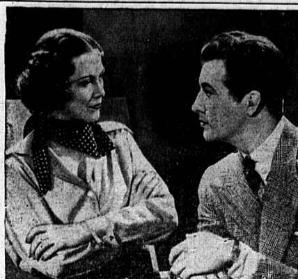
Eleanor Powell and Robert Taylor are featured in the tuneful, romantic "Broadway Melody of 1938" which opens tonight at the Torrance theatre.