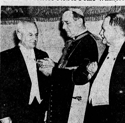
Archbishop John J. Cantwell is shown in center above as he awards two Nobel prize winners gold medals signifying papal recognition of their accomplishments in science. The two men thus honored at recent ceremonies in Los Angeles are Dr. Robert A. Millikan, left, and Dr. Thomas Hunt Morgan, right, both of whom are non-Catholics.