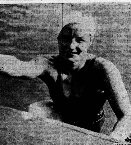
Pretty Katherine Rawls, New York, holder of the 300-meter individual medley title since 1931, retained her title in the National A. A. U. women's swimming championships by an easy win in the fast time of 4:35.3. Here is Miss Rawls being helped from Flieshacker Pool in San Francisco as she finished the medley.