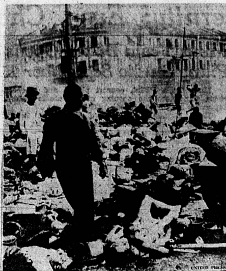
Bombardment of the crowded quarters of Shanghai left such horrible sights as the one shown above. This business intersection is crowded with mangled bodies.