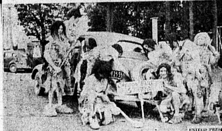
Grants Pass residents doll themselves up as cavemen and invade a California border checking station in another Oregon protest against the California checking stations which, it is claimed, are more difficult and tiresome to go through than many customs offices in foreign countries.