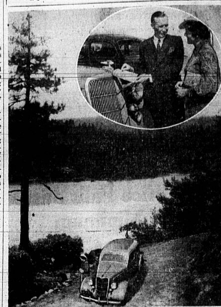
Stressing carefree summer driving and motoring safety on vacation trips, a plan to place mechanically sound used cars on the road is now in progress according to local Ford Dealers. Cooperation with motorists in this respect is the R & G used car plan which is a means used by Ford dealers to indicate renewed and guaranteed cars offered for sale. Pictured above is a satisfied R & G used car buyer on the road, which reports show, to trouble free mileage. Inset, the buyer appraises the R & G log which assures her 100 percent satisfaction or her money back.