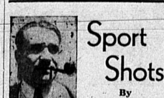
Best Los Angeles Track Meet of 1937 Season To Be Held Sat.

The 21st annual Gardens high school alumni dance will be held Saturday night, June 25, at the Hollywood Knickerbocker hotel and all Gardens grads are invited to attend.