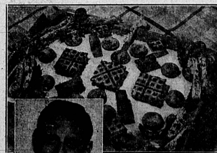
Friends Say Guy Lombardo's Cheese Sandwiches Are As Good As His Rhythmic Arrangements

HAVE you tried leading your beau out to the kitchen, tying a huge apron round his waist, and turning him loose to fix a toothsome midnight snack? Many people, you know, love to have a finger in the pie they eat, and there's no hospitality more winning than the kind that takes guests right into the kitchen—especially after ten p. m.