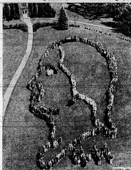
Gathered together for the 16th annual 4-H Club camp on the campus of Washington State College, these young boys and girls form a living portrait of the head of George Washington, father of their country and the namesake of their state. The photo was taken from the 160-foot tower on Bryan Hall.