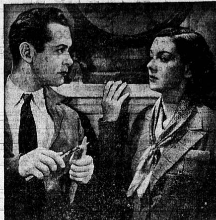
Robert Montgomery and Rosalind Russell in "Night Must Fall"

Adopting a technique of story construction that is entirely new on the screen, Metro-Goldwyn-Mayer introduces a novel picture in "Night Must Fall," which opens Sunday at the Torrance theatre.