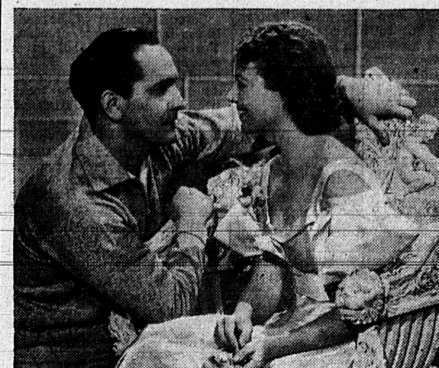
Here is Fredric March and Janet Gaynor in a gripping scene from "A Star is Born," an all-color production which opens Saturday at the Plaza theatre in Hawthorne.