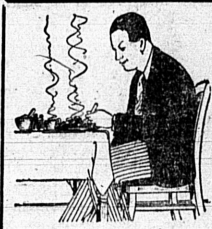
LUNCH AT DANIELS CAFE

California has collected a total of $6,429,020 in new revenues since instituting the beverage tax on beer and wine, and most of the money has come from sales of the state's own products, according to a board of equalization report.