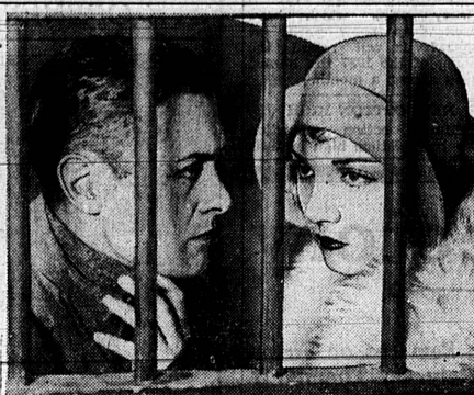
ROBERT MONTGOMERY and LEILA HYAMS in "THE BIG HOUSE"

Grim prison rioting; men herded like beasts in a house of hate; young prisoners educated in crime by hardened offenders; a sensational jail-break quelled by army tanks and dynamite. These are among the sensational elements of "The Big House," Metro-Goldwyn-Mayer's drama of prison life, which will open Sunday at the Torrance theatre.