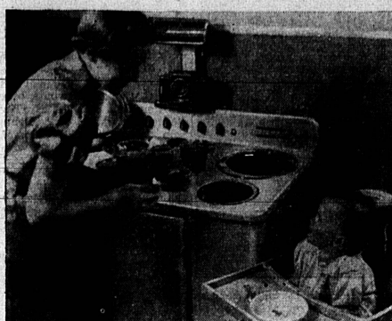
The remarkable Thrift Cooker of the modern electric range simplifies the preparation of baby foods.

one process. In the morning they are assembled and prepared for cooking. Then, seven or more, if you like—small jelly glasses are filled, each with one serving of food. In each of two jelly glasses, mother places 1 tablespoon of pulverized cereal, preferably a different kind in each glass, together with