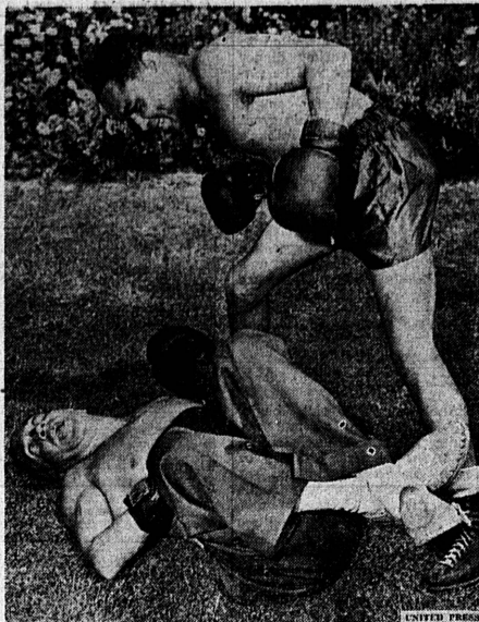
Shown in what is probably the most ludicrous pose in which he has ever had his picture taken, is Al Jolson, stage and screen comedian, curled up at the feet of Henry Armstrong, world's featherweight champion. Jolson, an ardent fight fan, recently purchased Armstrong's contract for a reported price of $10,000.