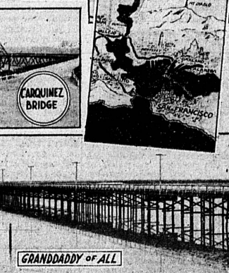
Easy 80-mile trip is made over $125,000,000 worth of bay area bridges, viewing beautiful scenery, spots of interest, in addition to crossing two bridges which are the very "best" in the world in their classes. Scout car made the trip on four gallons of Mobilgas, for an average of 20 miles per gallon. Bridge toll for the trip (estimating Golden Gate toll at $60) amounts to $2.40.

With the first stream of traffic moving May 28 over San Francisco's marvelous $38,000,000 Golden Gate bridge, and the thriving city of Vallejo participating in the gala opening by inviting the world to a celebration of Vallejo Day Sunday, May 30, the eyes of countless thousands are now centered on the San Francisco Bay area and its world-famous water spans.