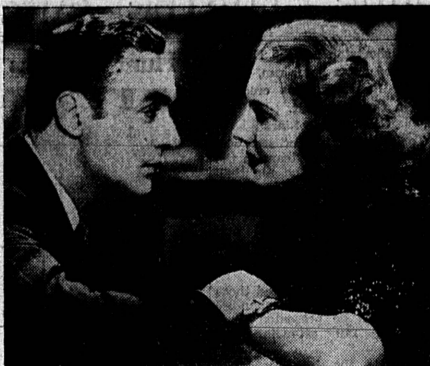
Charles Boyer and Jean Arthur in "History is Made at Night" which opens today at the Plaza theatre in Hawthorne.