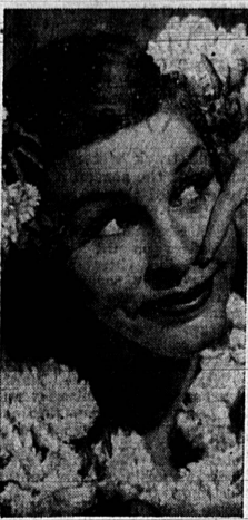
MARTHA RAYE "discovered" in Trocadero