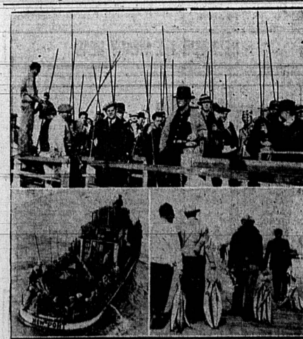
Upper photo—Eager Fishermen waiting to board Livebait Boats at Newport Pier. Lower left—Boats leaving for Fishing Grounds off the Orange County Coastline. Lower right—Anglers returning with their day's catch.

City officials at Newport Beach have ordered increased activity to speed up the completion of many modern improvements to care for the increasing number of sport fishermen who have taxed the facilities for handling the crowds even before the opening day of the ocean fishing season.