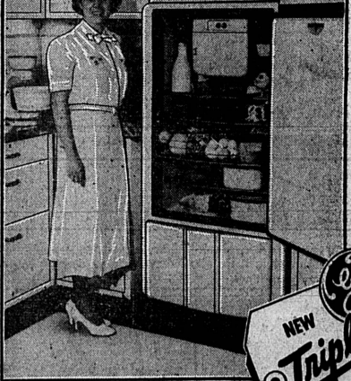
Model B-7, pictured above, $259.50. Pay as little as $14.29 down, $8.30 per month. Has every G-E feature... a large family model.

THE 11 beautiful new 1937 G-E Flat Top models and the new 1937 Monitor Top models are the finest refrigerators General Electric ever built. Yet they are priced lower—over 10% more than other standard makes. These new General Electrics give you more ice cubes, more cold capacity, more storage space, and more conveniences. And every model uses the super-powered General Electric vacuum sealed mechanism... famous for its quiet, economical operation, unmatched in its record of dependable, attention-free refrigeration service.