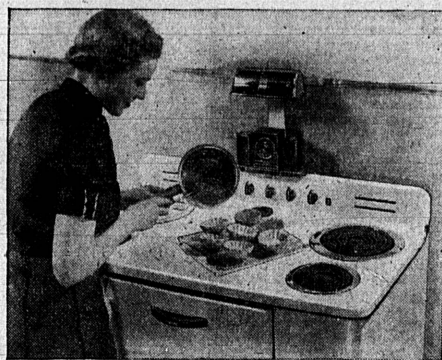
It takes little time to make delicious Rhubarb Cheese Pastry Tarts in a modern electric range.

"In the spring a young man's fancy" may turn to thoughts of love, as the poet says, but in this practical age his "fancy" is more apt to turn to thoughts of the delicious dishes that the season ushers to the table. As a matter of fact, don't we all look forward to the first