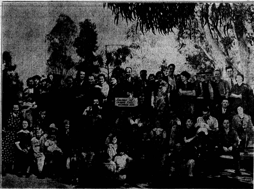
This picture shows the workers in the Mechanical department of the Columbia Steel plant here, their families and friends at a picnic held last month at Banning Park. See how many you can identify.