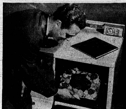
A man-made steak dinner prepared with the help of the new combination broiler and griddle of the electric range.

broiler to brown the potatoes. But let's tell you how it's done: Trim and wipe steak, salt, and spread with prepared mustard. Arrange steak on rack of the miracle broiler. Turn oven switch to broil. Set temperature control beyond very hot. When the unit is a glowing cherry red, place the broiler