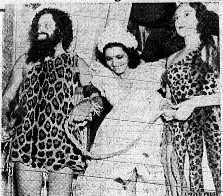
In the center, of course, having a little trouble trying to jump rope is Screen Star Ray Francis, and at her left, believe it or not, is Fredric March. At right is Mrs. March. The Marches were awarded the grand prize for the most original costume at a recent costume ball in Los Angeles.