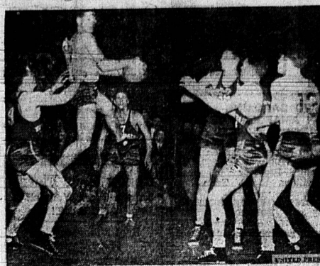
Coming from behind in the last minutes of play a snarling band of Cougars from Washington State are shown in one of the plays that gave them a surprise victory over the University of Washington in the first leg of a three-way playoff for the Northern Conference title.