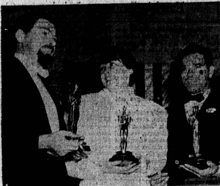
The recent annual dinner of the Motion Picture Academy of Arts and Sciences saw the award of gold statuettes to two Austrian actors and to the Italian, Frank Capra; for their work during the past year. At left is Paul Muni, given the award for his work in "The Story of Louis Pasteur"; center is Lulu Rainer, whose performance in "The Great Ziegfeld" won her the honor; at right is Capra, director of Hollywood's best picture in 1936, "Mr. Deeds Goes to Town."