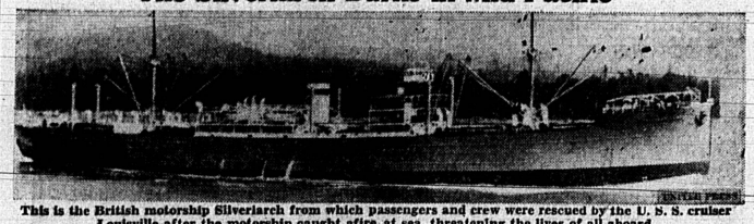
This is the British motorship Silverlarch from which passengers and crew were rescued by the U. S. S. cruiser Louisville after the motorship caught fire at sea, threatening the lives of all aboard.