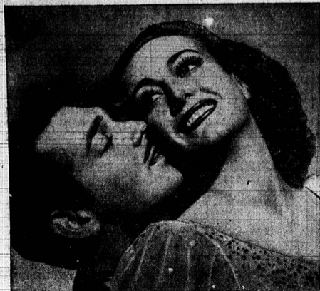
Clark Gable and Joan Crawford in "Love on the Run" which starts Sunday at the Plaza theatre in Hawthorne.