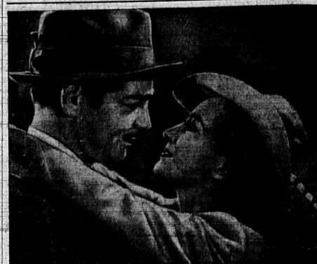
Clark Gable and Joan Crawford in "Love on the Run" which opens a three-day run tonight at the Torrance theatre.