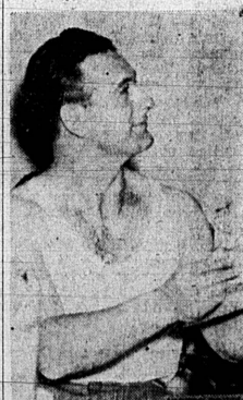
Lou Gehrig, baseball's highest-priced player, is shown receiving instructions from a motion picture director on how to act—act for the movies, that is, not how to behave around first base, where he is an expert.