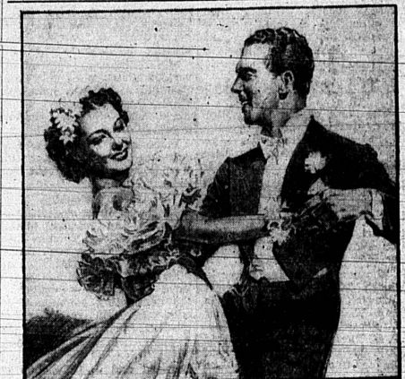
Gladys Swarthout and Fred MacMurray set the pace for "Champagne Waltz," opening Sunday at the Torrance theatre.