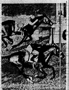
This is the official photo of the finish of the $100,000 handicap at Santa Anita track, won by Rosemont in a thrilling drive down the stretch. The winner is shown crossing the finish line and automatically releasing the camera shutter so that photographic evidence is available in a dispute over who is the winner in close finishes. Seabiscuit is shown in second place, farthest from the camera.

The $10,000 added San Juan Capistrano Handicap on "Get-away Day" Saturday, which draws the entry of many of the candidates for the Big Cap, promises another banner turnout. On the last day last year, the biggest crowd on record—estimated 46,000—was in attendance.