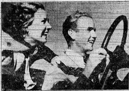
THE SPIRIT OF AMERICA

Automobile clubs, tourist agencies, motor car dealers and petroleum companies are prepared for enormous business this year, in line with an increase in motoring traffic expected to pass all previous records. Yes, say officials of General Petroleum Corporation, marketers of Mobilgas, this year's traffic increase is expected to surpass the approximately 36 percent gain recorded in 1936. Reasons assigned for this are the early and heavy purchases of new cars and the many millions expended in new Western highways. Surveys conducted in thousands of Mobilgas stations, credit by financial writers with the heaviest gains of any group, indicate that motor travel is mounting materially.