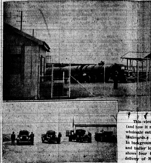
This view (and how it is) shows the whole new plant. In background and trailer lot shows four delivery of M