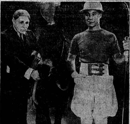
Joe E. Brown (right) with Richard (Skeets) Gallagher—as the considerate valet who brings in a donkey so his master may have a bit of practice for his polo in a scene from "Polo Joe," opening Sunday at the Torrance theatre.

The Chinese, Arabs, Greeks, Etruscans, Finns and Italians in London are trimmed with tin flowers or gold and silver feathers.