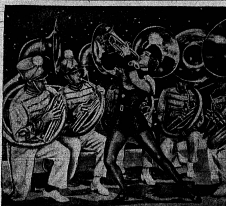
Eleanor Powell in a scene from "Born to Dance"