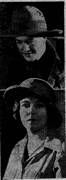
Martin and Osa Johnson

Martin Johnson, with his wife Osa, who are world-famous for their explorations, will reveal in motion pictures discoveries they made on a recent expedition into "wildest Borneo" when they appear at Shrine auditorium in Los Angeles, January 14, and at the Civic auditorium, Pasadena, January 12, under the auspices of the Pacific Geographic Society. The Johnsons spent the past year in North Borneo, photographing the Murat and Tengarrak tribes, former headhunters, who dwell in a beautiful land of jungled rivers where also live some of the most graceful and beautiful of the ape family, the Gibbons and the rare Proboscis monkey. Tickets are available at the Southern California Music Company, 737 South Hill street, Los Angeles, telephone TUcker 1144, or at the box office of the Civic auditorium, Pasadena, telephone Wakefield 5473.