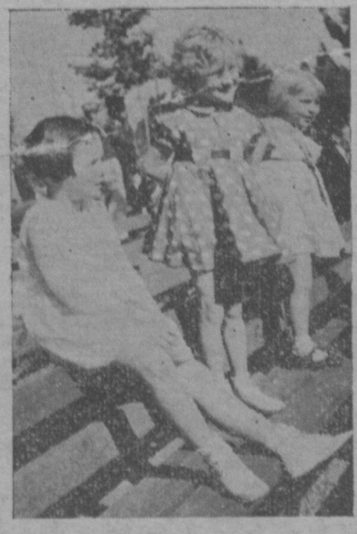
At Boys' Day!