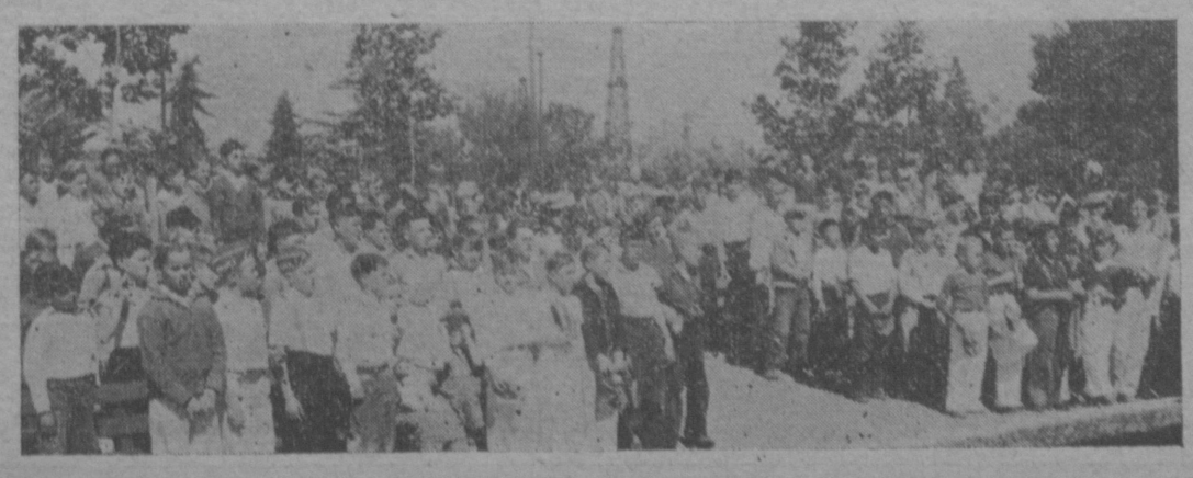
Boys' Day at Municipal Park.