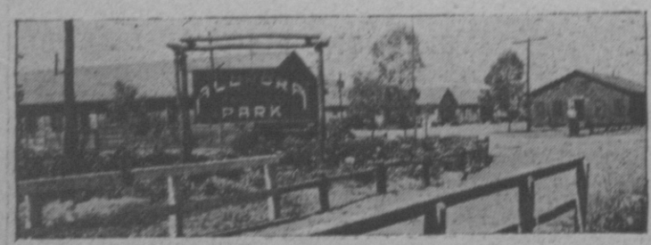
Government Has Had Men Working Under WPA Program.