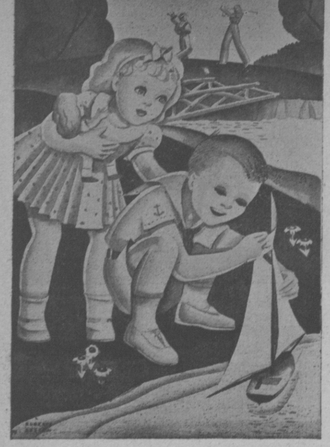
Tomorrow's Children Will Enjoy Alondra Park-Planned to Be Chief Recreational Site.