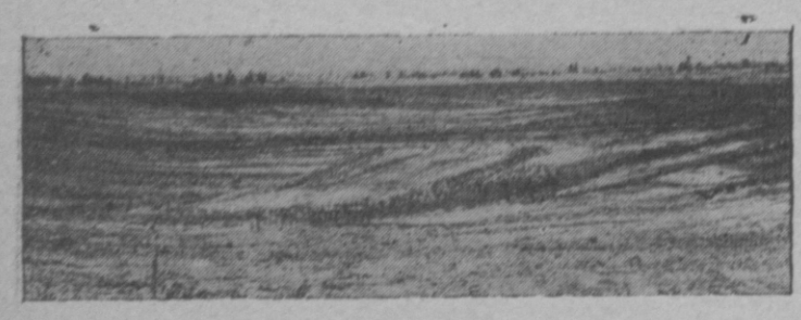
A Hole in the Ground Today. Tomorrow-a 10-Acre Lake.