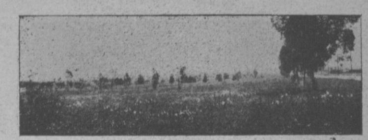
Thousands of Trees Have Been Planted in