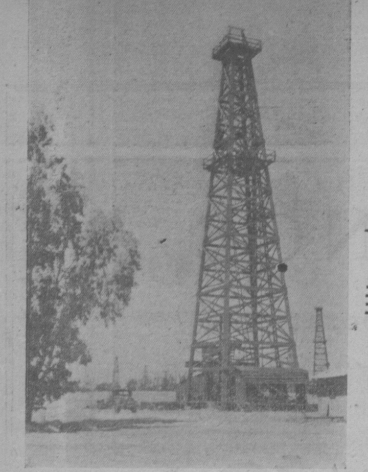
Huge Tree Shades Del Amo No. 1, Discovery Well of the Torrance Oil Field.