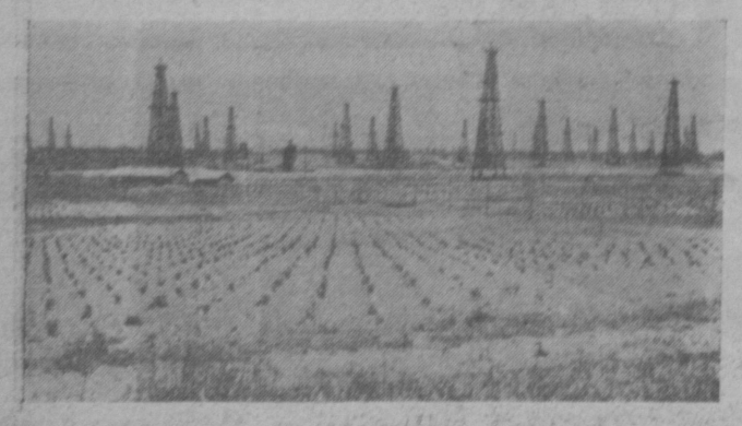
Tented Tomato Plants (Above) Stand Like Soldiers as Flowers Bloom Amid Derricks. (Below)