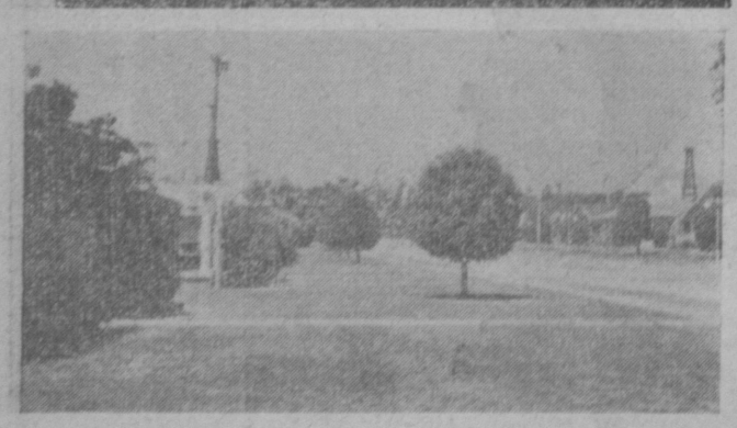
Beautiful Lawns Grace Workers' Homes.

Rield comes to edge of but does not intrude on built up portion of city.